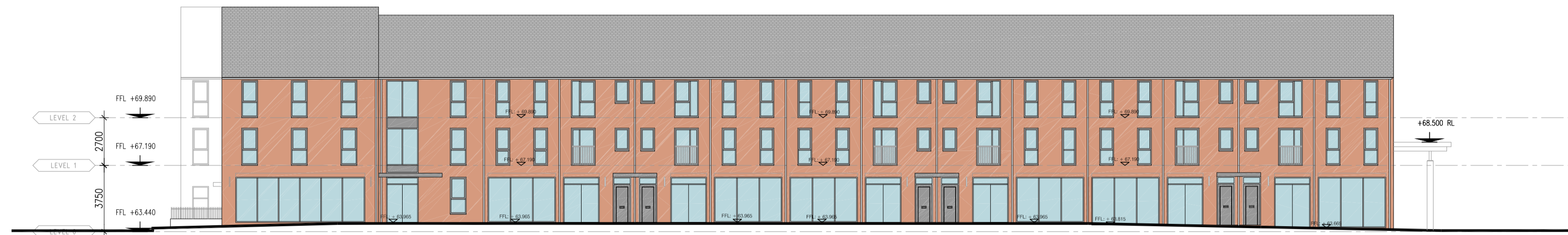
NORTH ELEVATION 01-01