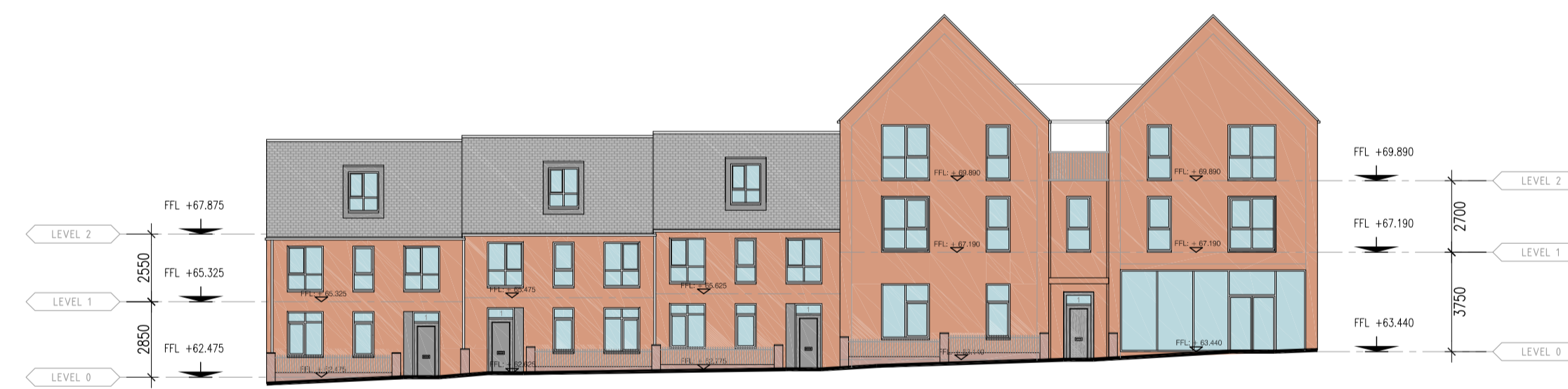
EAST ELEVATION 03-03