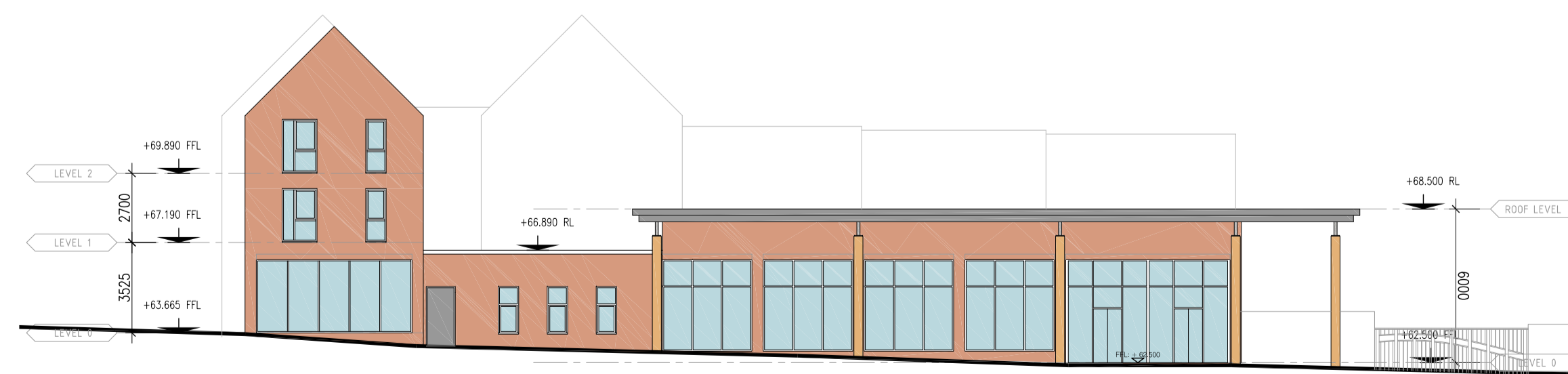
WEST ELEVATION 04-04

Notes All dimensions to be verified on site. Do not scale this drawing. All discrepancies to be clarified with project architect. This drawing is the property of Benoy Architects and is issued on the condition it is not reproduced, related or disclosed to any unauthorized person, either wholly or in part without written consent of Benoy Ltd. Distance Survey material is used with the permission of The Controller of HMSO, Crown copyright AH 159875. The CDM hazard management procedures for the Benoy aspects of the design of this project are to be found on the "Benoy - Designer's Hazard Identification and Management Sheet" and/or drawings. The full project design team comprehensive set of hazard management procedures are available from the Planning Supervisor/Safety Coordinator appointed for the project.